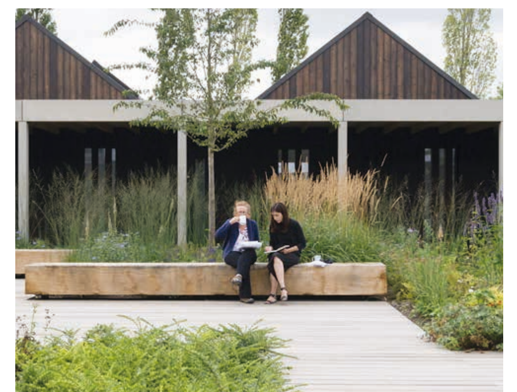
Communal Courtyard - Designed with Places to Dwell